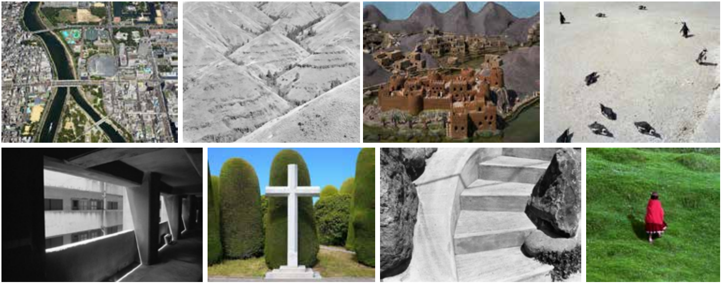
From upper left ; JP-34 04, 2015 / WASHINGTON 2000 #79, 2000 / MCT 17551, 2012 / CPT 27741, 2018 / Hashima 1983, 2017 / PUQ 141133, 2015, Private collection / TRANSIT, 1984-85, Private collection / 31EC, 2007