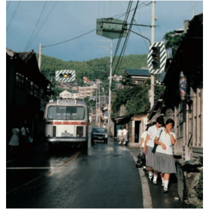
Untitled, Atago, 1975