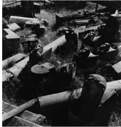
Statue of angels at Urakami Tenshudo Catholic Cathedral which was destroyed by the blast, Mottoo-machi, 1961