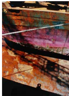
Dockyard 7 Nagasaki-dock Dockyard, Naminohira-machi, 1997